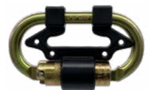
Twin Models Only