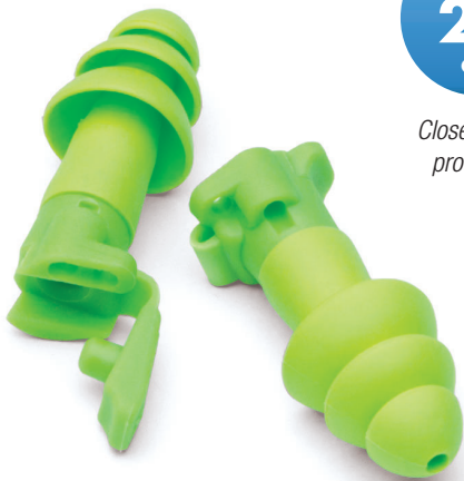
With Optional Cord